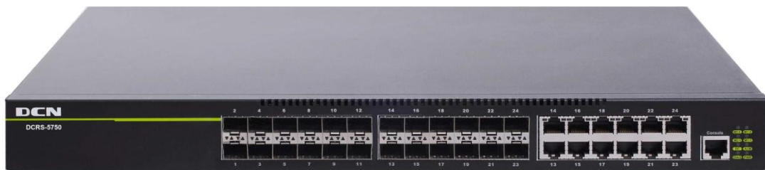
DCRS-5750-28F / DCRS-5750-28F-DC